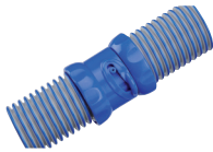
Twist Lock Hoses